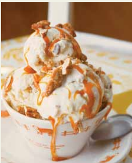
Save room for the Brown Butter Pecan Sundae at LA Creamery Artisan Ice Cream.